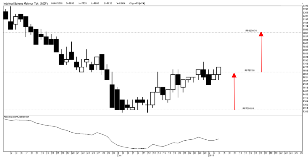
Kinerja saham INDF

Danareksa research report are also available at Reuters Multex and First Call Direct and Bloomberg